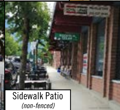
Sidewalk Patio (non-fenced)